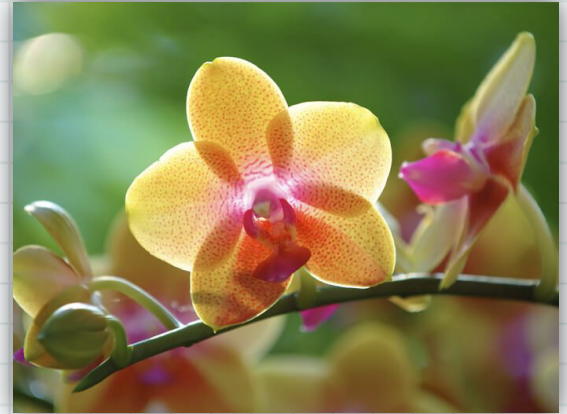
Our Orchid collection contains 100 varieties, which include hybrids and species.

The C. Fred Edwards Conservatory opened in 1996 and is West Virginia's only plant conservatory. It features tropical and subtropical plants. The plants in our collection fall into four general categories: Orchids, Agriculturally Important, Fragrant, and Unusual.