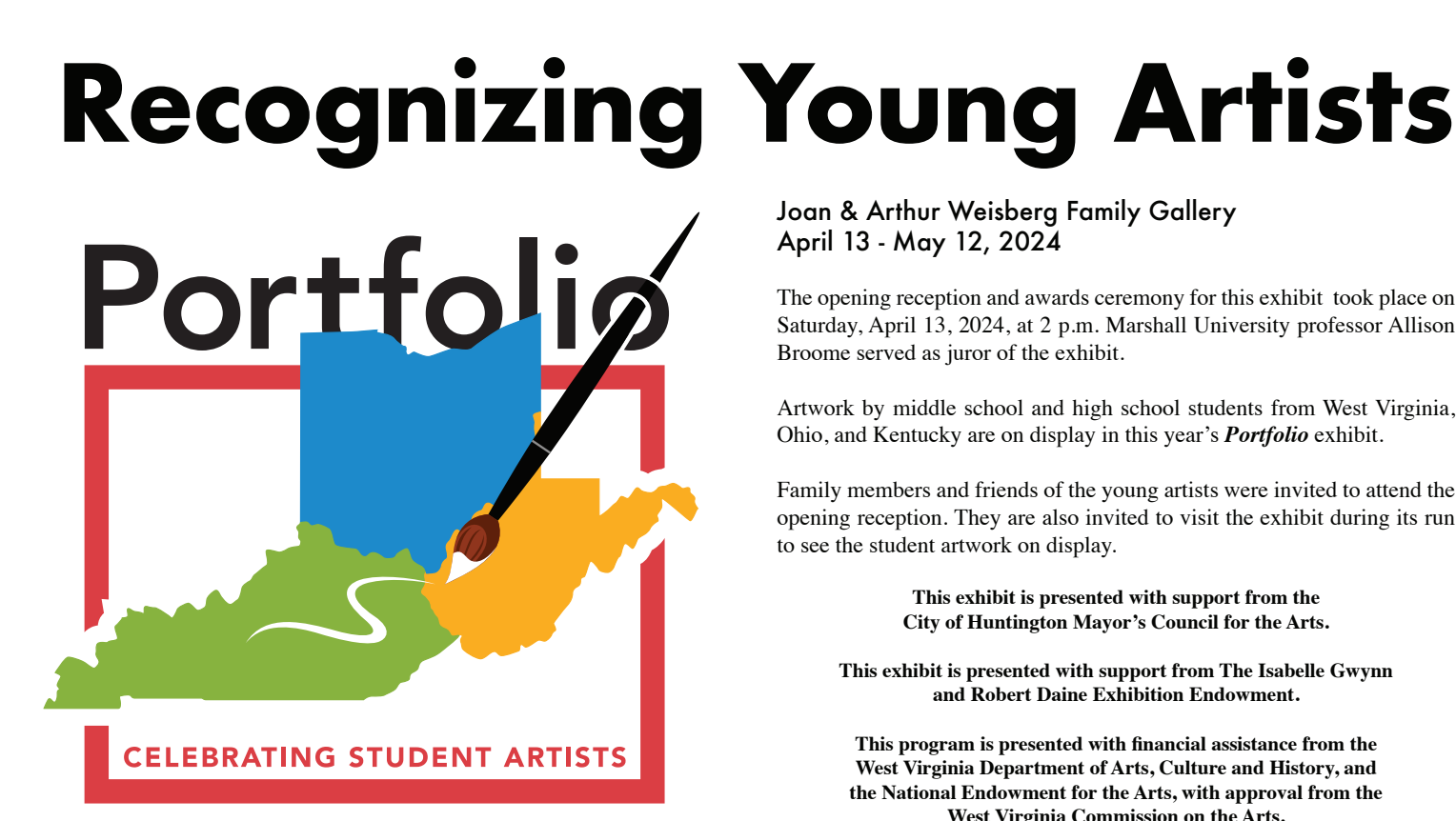
Graphic by Bulldog Creative Services.