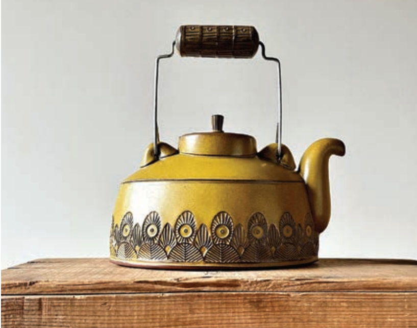
Sarah Pike, Grouping of slab-built forms in Gold Glaze, 2022. Red stoneware, Gold Glaze, wire and wood.